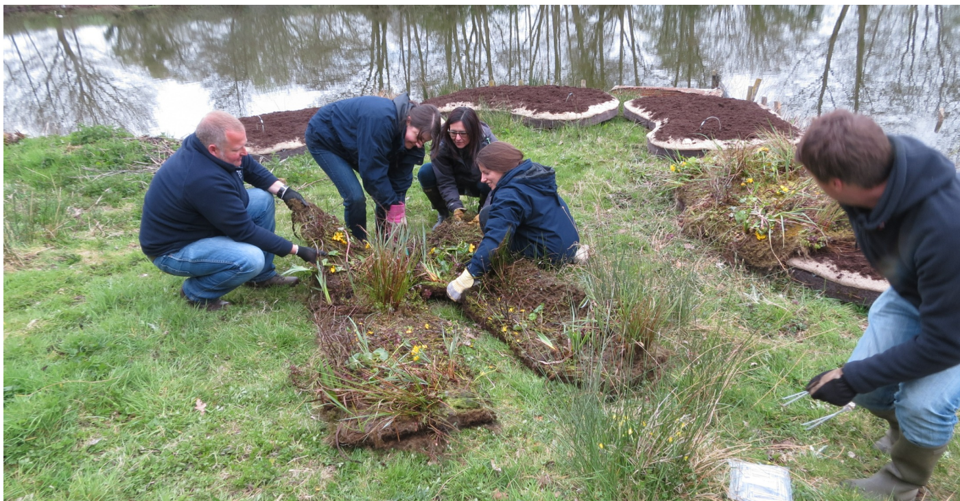
Pre-planted coir mats are then cut to size and placed on top of the substrate and soil. They are pegged into place with large metal staples.