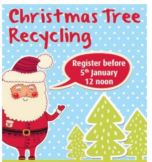
Register now www.farleighhospice.org/treerecycling