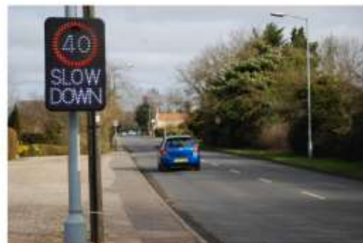
40mph Slow Down Vehicle Activated Sign (VAS)