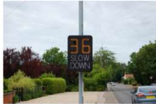
Speed Indicator Device with additional text